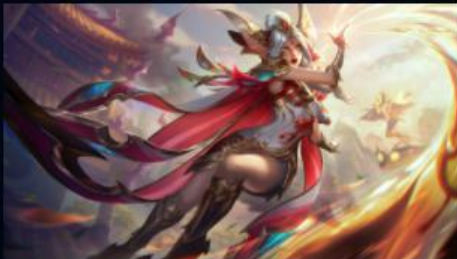
Brave Phoenix Xayah Prestige Edition