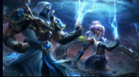
Shockblade Qiyana/Shockblade Shen