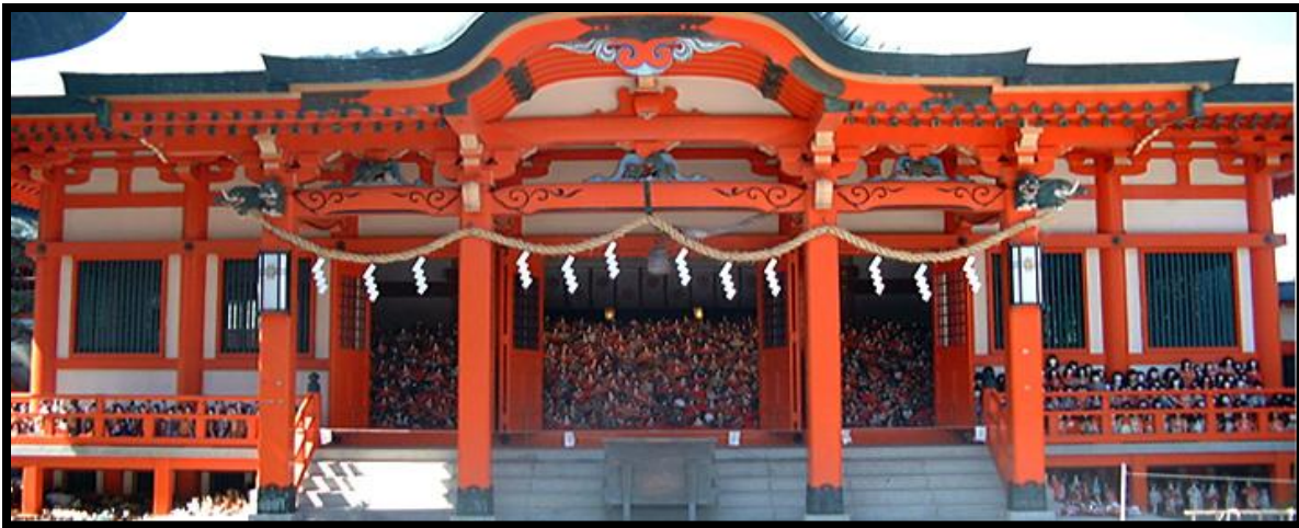
Kada Awashima Shrine, 2013.

In this sense the puppet becomes a direct interface not only for humanity to negotiate access to the realm of the spirits, but also a way for that realm to access the mundane world and, through that, the already complex significations of man and spirit are given an